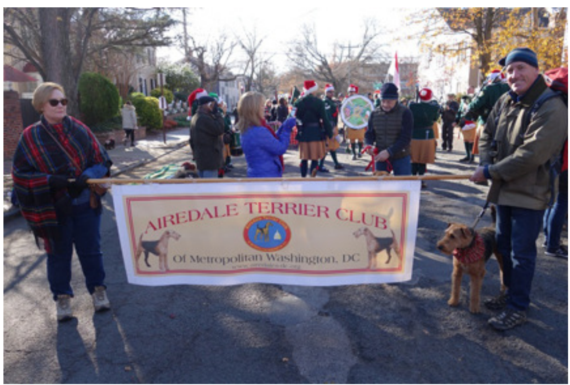
Airedales in the Scottish Walk in Alexandria