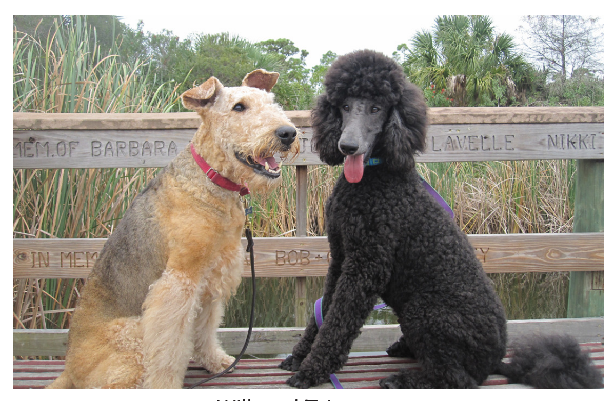
Willa and Tristan

Most dog parks, training facilities, and competition venues permit intact males and only restrict females in season. While behaviors such as aggression and mounting are problematic, these behaviors are regularly displayed by altered dogs of both genders. The assumption that intact dogs are more likely to display unacceptable behavior is simply unfounded.