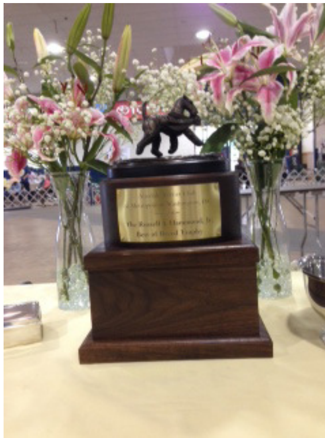
Airedale Terrier Club of Metropolitan Washington, DC The Russell J. Hammond, Jr. Best of Breed Trophy