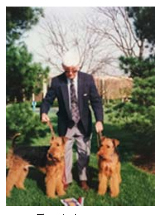
The winning years.