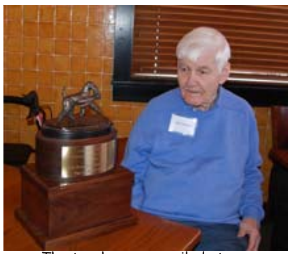
The trophy was unveiled at our March 15, 2014 meeting.

sharp, successful man to later be trapped in a body frozen by Parkinson's. Yet, these later years were his finest and a testament to his courage. He fought the good fight, he finished the race, he kept the faith."