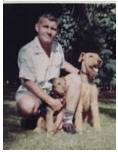
The early years.