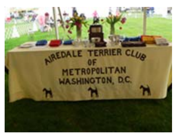
The beautiful trophy table.