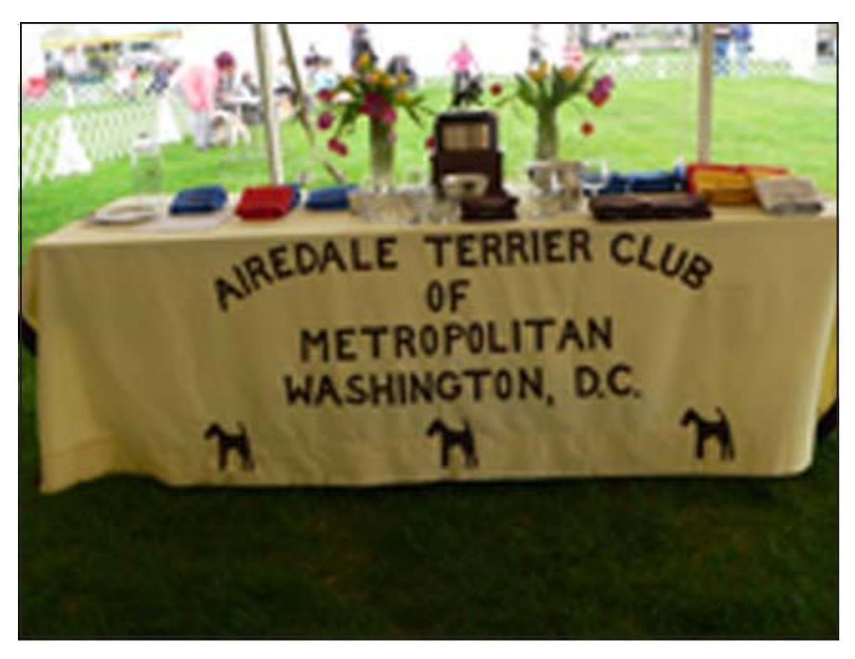
ATCMW 2016 Specialty Trophy Table